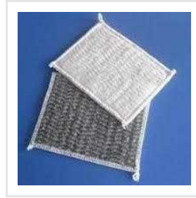
Geosynthetic Clay Liner