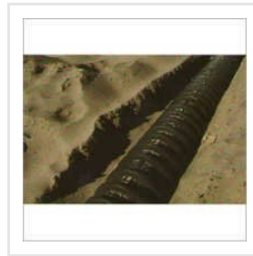
Non Woven Perforated Geopipe