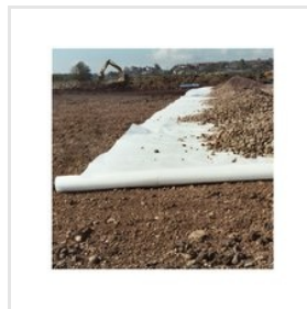
Erosion Control Materials