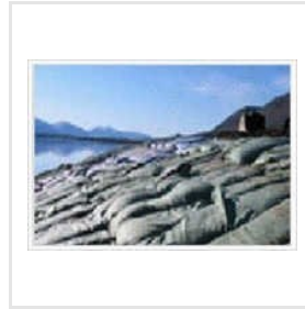
Non Woven Geo Bags