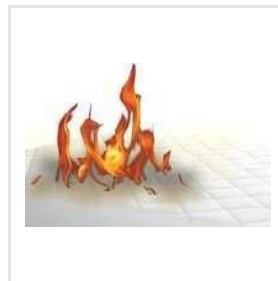
Fire Barrier Mattresses