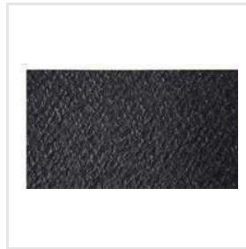
Textured HDPE Geomembrane